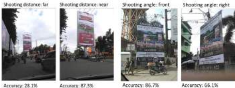
Figure 3. Two advertisement billboard images with different shooting distances.